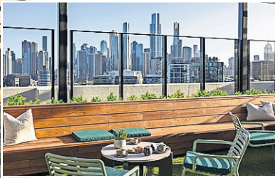
The Alba’s rooftop terrace is just one of many amenities provided at Australian Unity’s Albert Park Lake community.

“At The Alba, our easy-living one- and two-bedroom apartments offer premium accommodation,” Vance says. “They have been designed to be easy, safe and convenient for older people, so there are no steps or narrow corridors and doorways, and each apartment is spacious and light-filled.